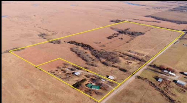
75+- Acres Butler County, Kansas Land South of Leon ABSOLUTE!

REAL ESTATE PROPERTY WILL SELL AT 11:00 A.M.