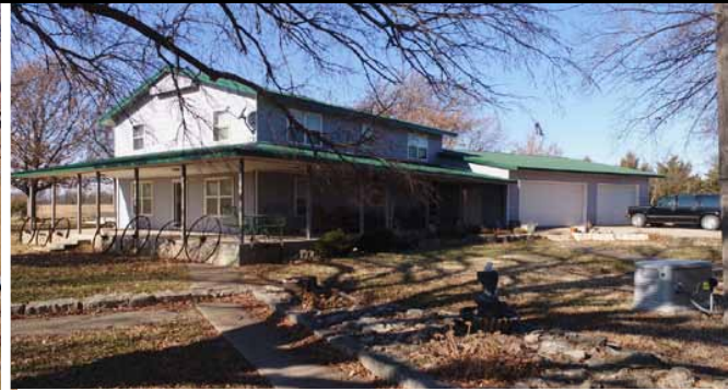
Farm House & Buildings on 5+- Acres Butler County, KS South of Leon